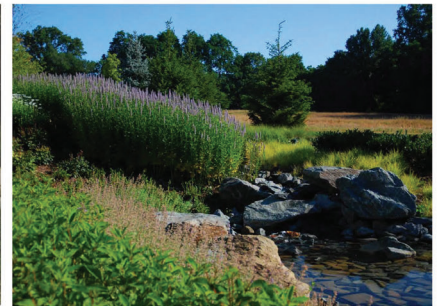
NATURE PLAY STREAM