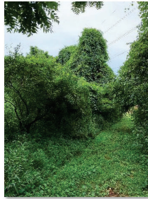
Before June 2019