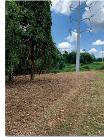
Resulting In Spaces For Site Programming