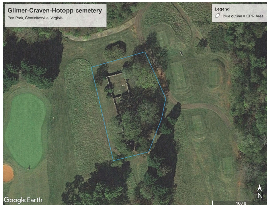
Proposed GPR Survey Area

NEW YORK 225 N. Route 303, Suite 102 Congers, New York 10920 (845) 268-1800 (845) 268-1802 Fax