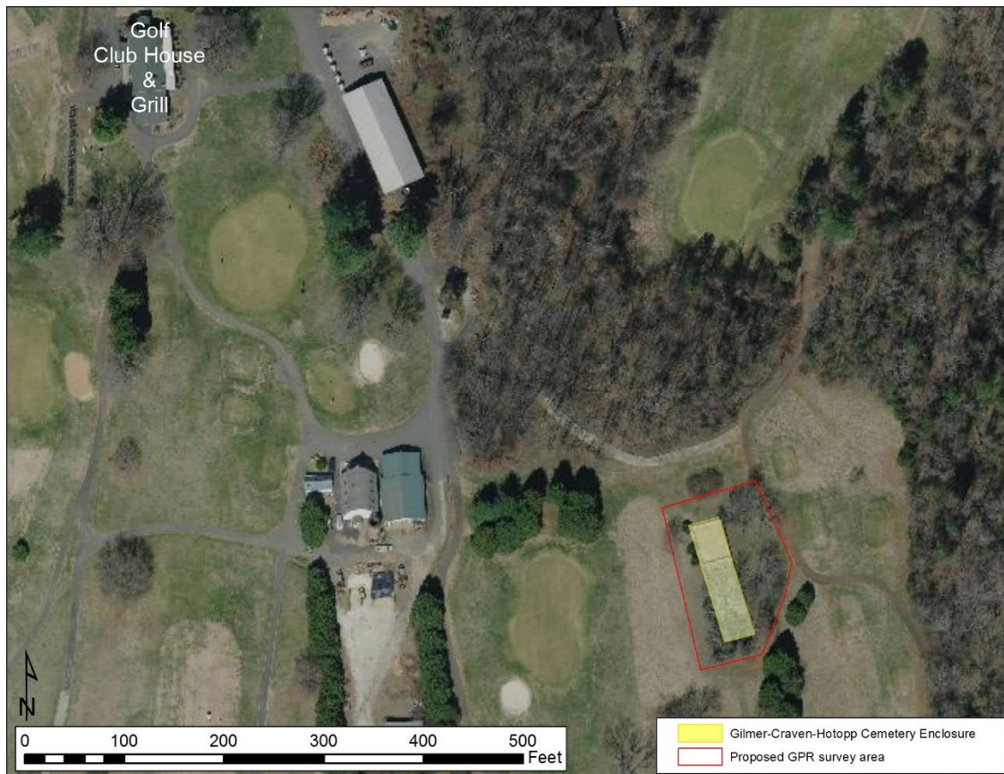
Figure 1: Aerial photograph over Pen Park showing the location of the Gilmer-Craven-Hotopp Family Cemetery and the proposed GPR survey area.

Rivanna Archaeological Services (RAS) is pleased to submit this proposal and cost estimate to coordinate a short program of ground penetrating radar (GPR) survey coupled with archaeological ground-truthing excavations at the Gilmer-Craven-Hotopp Family Cemetery located within Pen Park in Charlottesville, Virginia. The GPR survey will be conducted on terrain immediately surrounding all sides of the ca. 130-ft by 30-ft cemetery enclosure with a particular focus on the eastern side where surface indications suggest the presence of unmarked burials, possibly of enslaved periods, outside of the walls of the historic burial ground. The total area to be examined by GPR is approximately 12,800 square feet (0.28 acre) ( Figure 1 ).