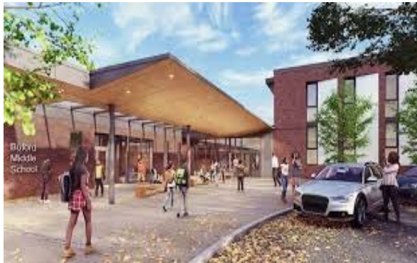
BUFORD SCHOOL RECONFIGURATION