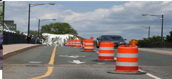
BELMONT BRIDGE REPLACEMENT