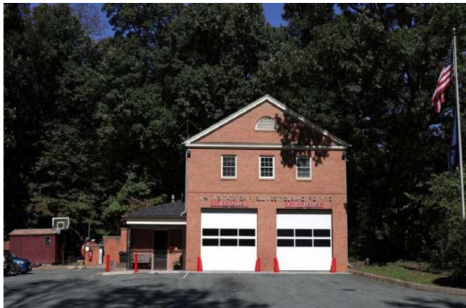
BYPASS FIRE STATION REPLACEMENT