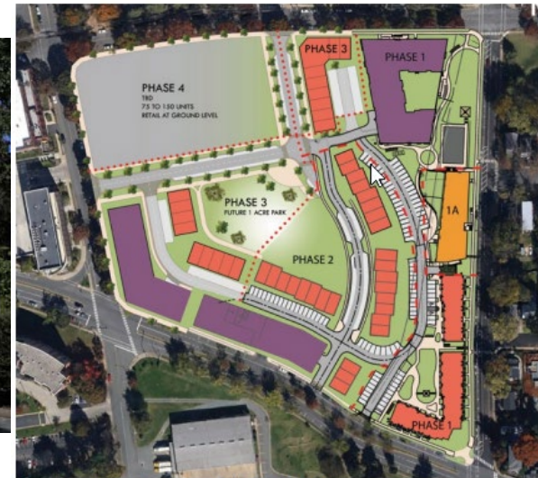
FRIENDSHIP COURT REDEVELOPMENT